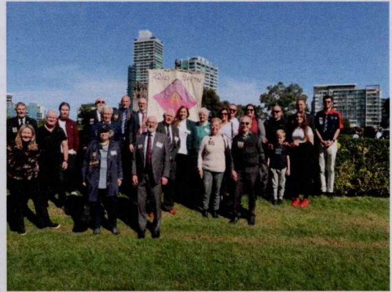
22nd Battalion Association members at the Shrine after the March