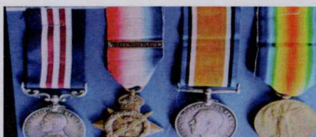
World War I medals- Military Medal on the left

The women worked in hospitals, on hospital ships and trains, or in casualty clearing stations closer to the front line. They served in locations from Britain to India, taking in France and Belgium, the Mediterranean, and the Middle East. Many of them were decorated with eight receiving the Military Medal, the nurse's equivalent of the Victoria Cross.