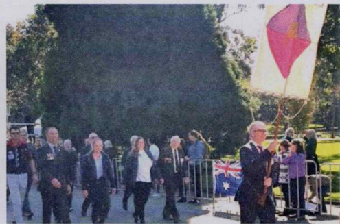
22nd Battalion Ass. Members behind the banner 20122

Successive generations has made Australia the enviable country of hope for those who are fortunate to be Australian and those, whose hope it is to be so.