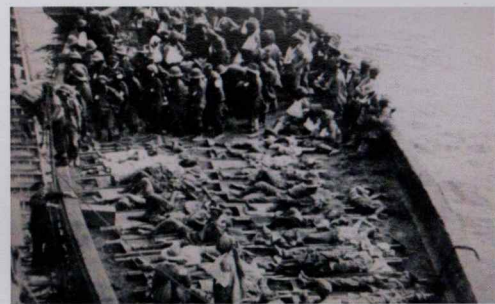
Casualties for transfer to hospital transport Gascon

From the landings on 225 April 19915, nurses cared for hundreds of casualties in the hospital and transport ships anchored off-shore. The wounded came in an endless stream, day and night, some barely able to walk, others on stretchers, shivering or unconscious through loss of blood. Medical supplies were limited and there was a desperate lack of fresh water. Despite the constant threat of Turkish shelling or torpedoes, the exhausted nurses, cleaned, bandaged, warmed and comforted their patients, many of whom had ghastly wounds or were suffering from the effects of gangrene and disease.