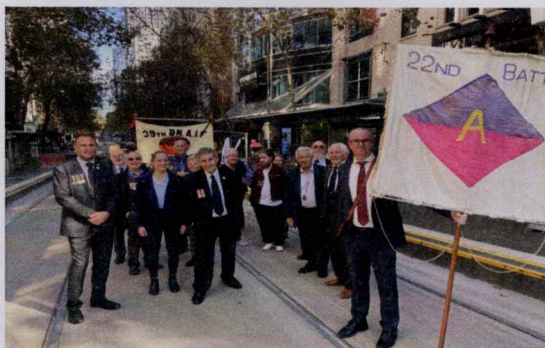
22nd Battalion Association members assembling at start of 2022 March

Recently, reflections on our initial colonial settlement and the ancient history of the indigenous population highlight the breadth and richness of this cultural diversity. Injustices perpetrated at this time have to be judged in conjunction with the ensuing benefits, the infusion of many ethnic cultures by migrants hoping for a better life.