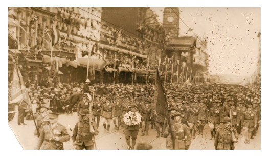
22nd Battalion behind it's Colours Anzac Day March 1920

As a consequence, again the democratic values of freedom and respect for humanity are being challenged and again it is a "call to arms" as heroically displayed by the Ukrainian people.