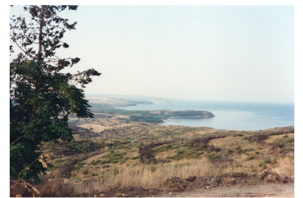
From Lone Pine Cemetery overlooking the whole front line of May 1915

4900 Australian and New Zealand soldiers died in the Anzac area.